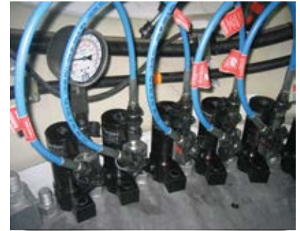
360° degree swivel action ensures that the hoses are positioned where you want them.

Due to the very limited space available in many blade bolt compartments and to help where many tensioners are connected together every Aero WTB tensioner has the option of a 360° swivel connection. This 360° swivel operation allows the hydraulic hoses to be positioned in the best possible position to allow open access to the tensioning tools.