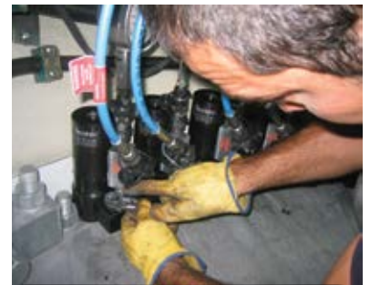
Geared Nut Run-down, allows for rapid seating of hexagon nut.

The inclusion of a gear nut run-down mechanism offers a very rapid and consistent way of seating the hexagon nuts during the tensioning procedure. A common 1/2" square drive hand torque wrench can be used to rapidly seat the nuts to the required 30Nm (Max) torque.