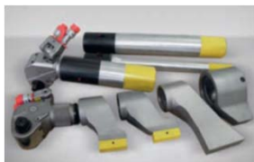
Extended Reaction Arm