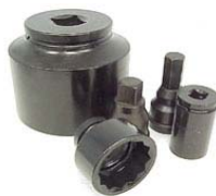
Impact & Allen Key Socket